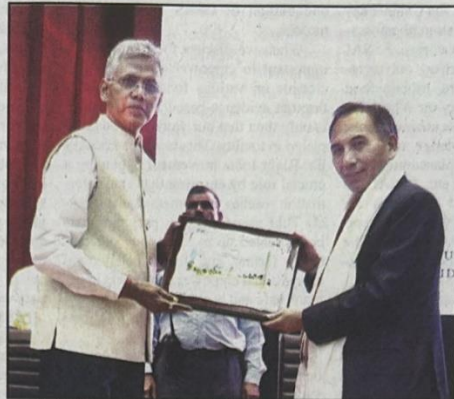
A dignitary welcoming Chief Justice Tashi Rabstan at IIM Jammu on Friday.

Justice Rabstan also participated in a sapling plantation ceremony, symbolizing environmental sustainability.